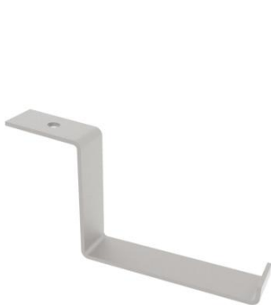
① Front Ballast Leg