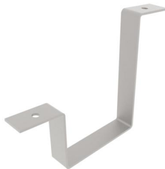
② Mid Ballast Leg