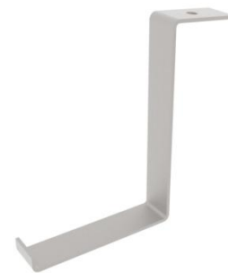
③ Back Ballast Leg